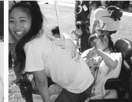
Making things work TOGETHER