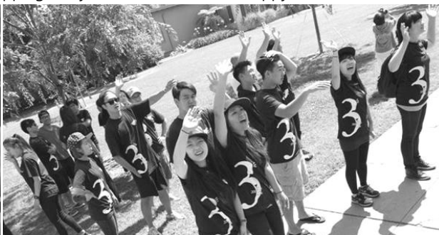
Saying "Good-bye" is never easy...

Hope to see each and every one of you at 2014 Camp AGAPE!