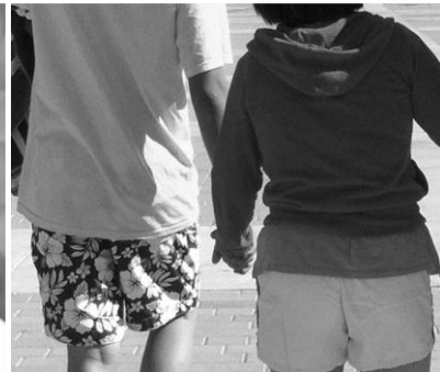
Holding Hands ♡