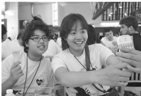
Capturing Every Moment with You