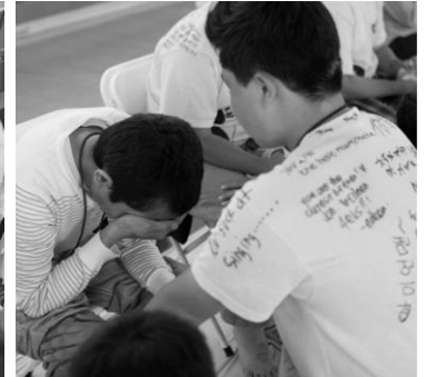
Mauddy Ceremony – Our volunteers washed the feet of our participants just as Jesus washed the feet of His disciples.