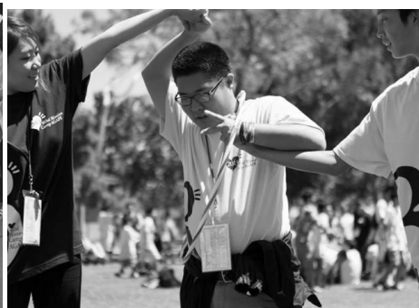
Getting through Obstacles TOGETHER