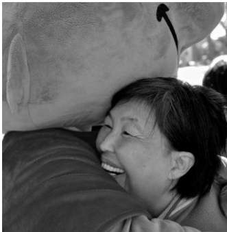
Welcome to 2013 Camp AGAPE