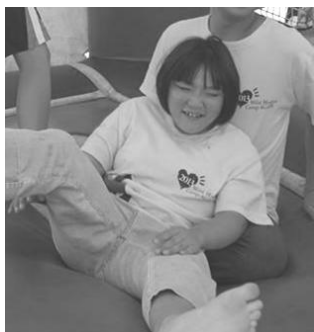
In the Bounce House