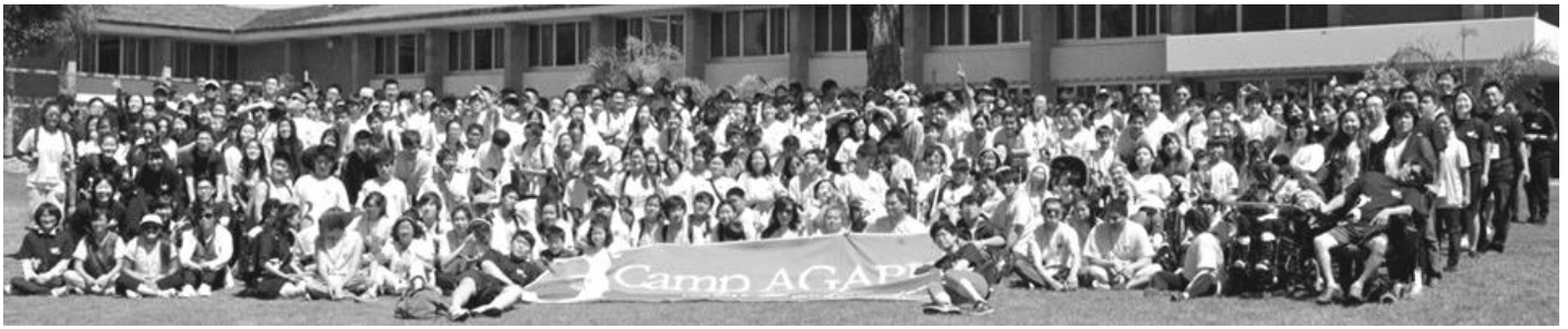
2013 Camp AGAPE Group Picture: All 450 of us enjoying each other's company