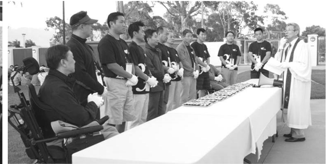
Communion Ceremony – Remembering Christ's Love for Us