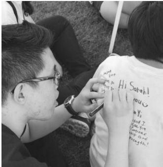
Sharing the Love