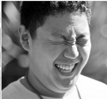
Happy to be at Camp!