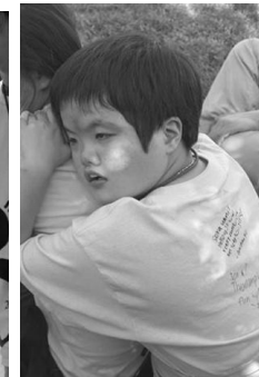
"Lean on me~"