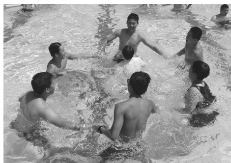
Happy Swim Time!