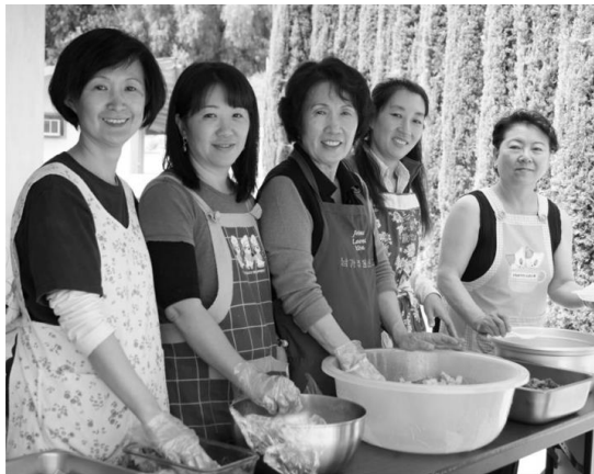
Parents serving lunch @ OC